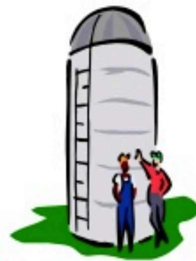
Sales & Marketing